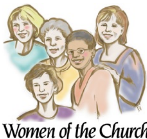
Women of the Church

Please join us for our next meeting on Saturday, July 15 at 11:00 a.m. in Luther Hall. This would be a good time to bring Ladies Aid any suggestions that you have for the kitchen renovation.