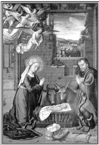
THE NATIVITY by Gerard David (1460 - 1523)