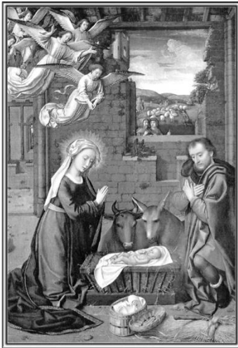
THE NATIVITY by Gerard David (1460 - 1523)