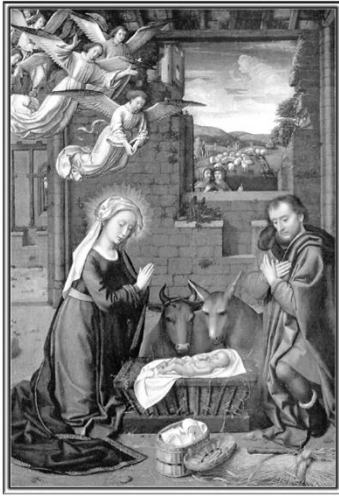
THE NATIVITY by Gerard David (1480 - 1523)