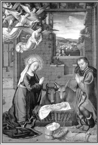
THE NATIVITY by Gerard David (1480 - 1523)

St. Luke proclaims the birth of our Lord and Savior Jesus Christ.