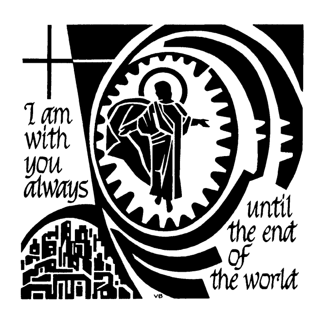
Prayer before Worship

Seventh Sunday of Easter – Series A Lutheran Service Book, pp. 219-228 May 24, 2020